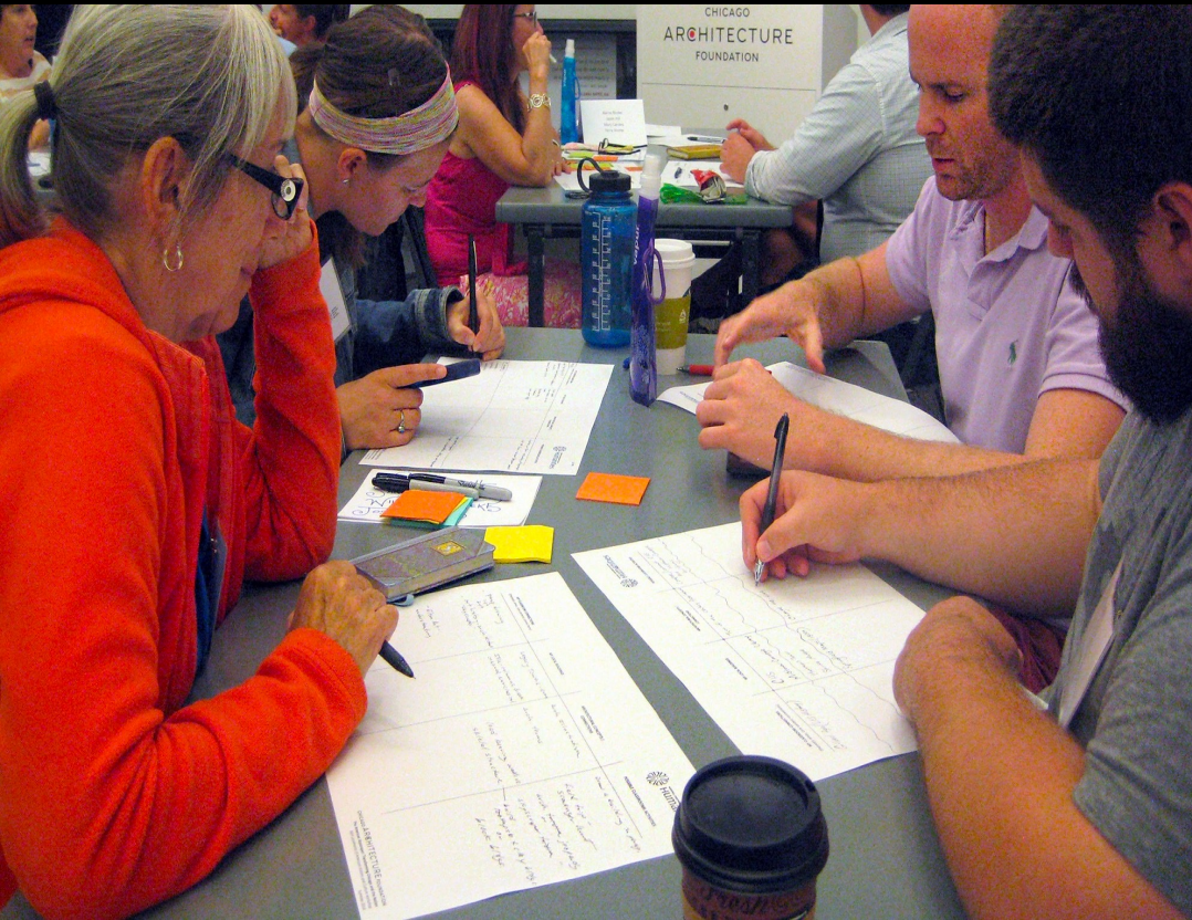
Image of teachers working together at a table.