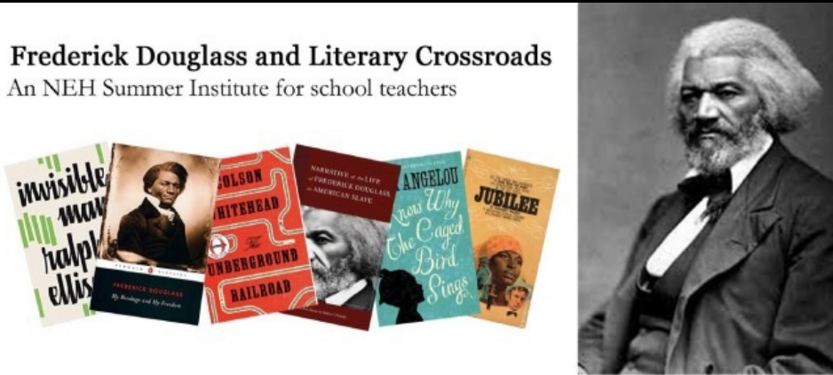
Image of Frederick Douglass and books.

Supports professional development programs that convene K-12 educators and higher education faculty from across the nation to deepen and enrich their understanding of significant topics in the humanities and enhance their capacity for effective teaching and scholarship.