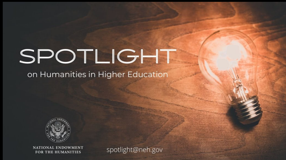
Image of an illuminated light bulb on a wooden table.

Supports the exploration and development of small projects that would benefit underserved populations through the teaching and study of the humanities at small to medium sized institutions of higher education.